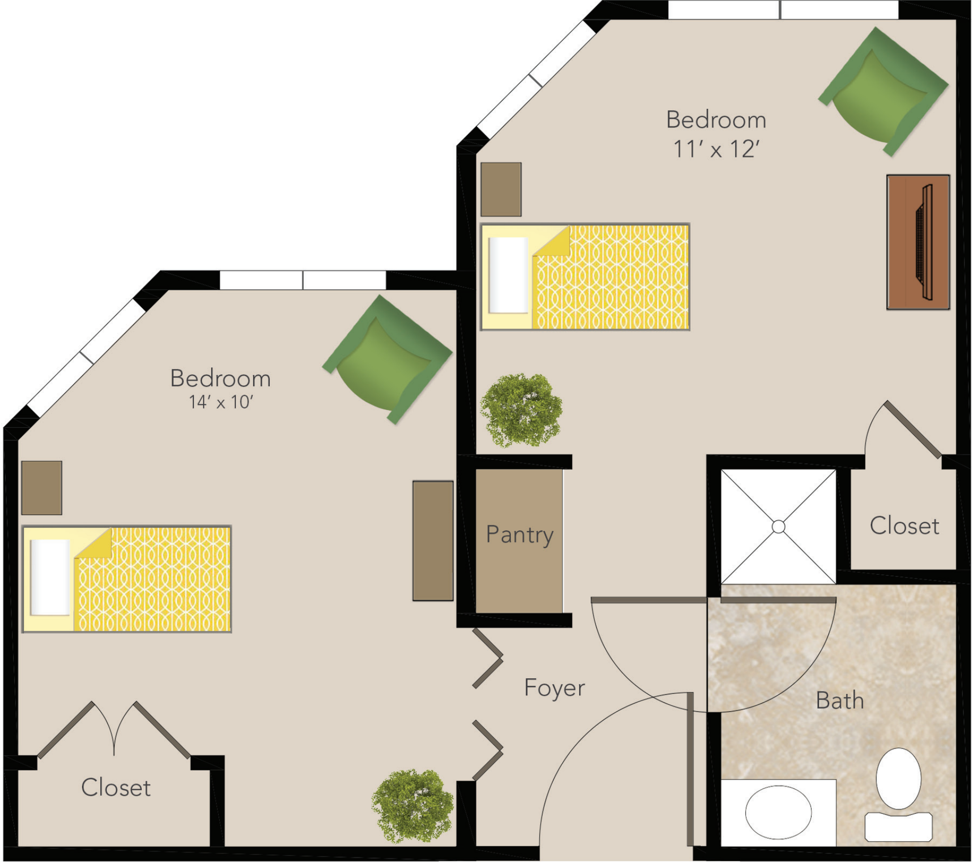
Deluxe Semi-Private Room